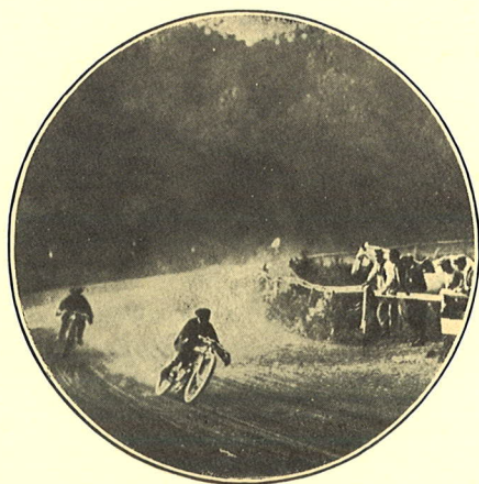
Early Motorcycle Racers