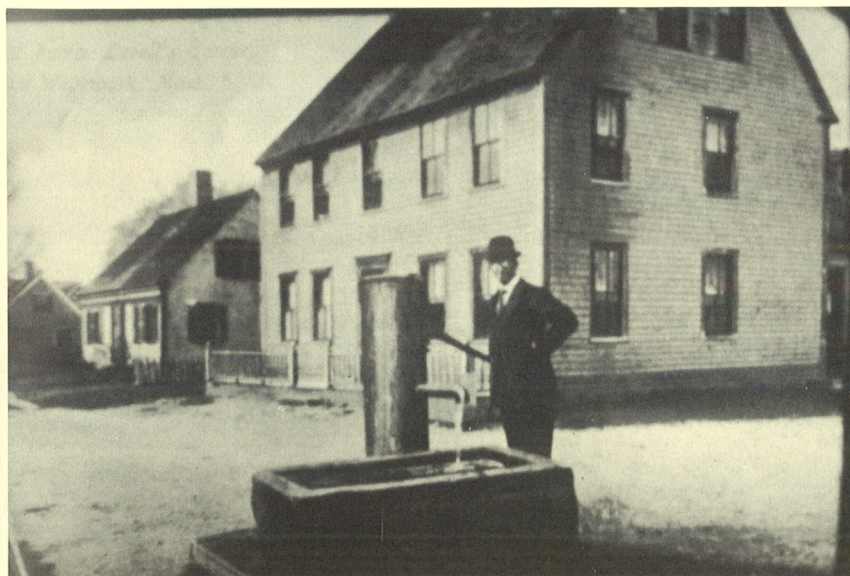
Lovell's Corner 1914

The old pump and watering trough were located where the Texaco Station now stands.