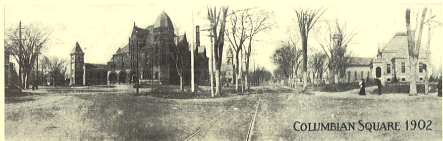
COLUMBIAN SQUARE 1902

(Site now occupied by Weymouth Lumber Co. on Mill Street)