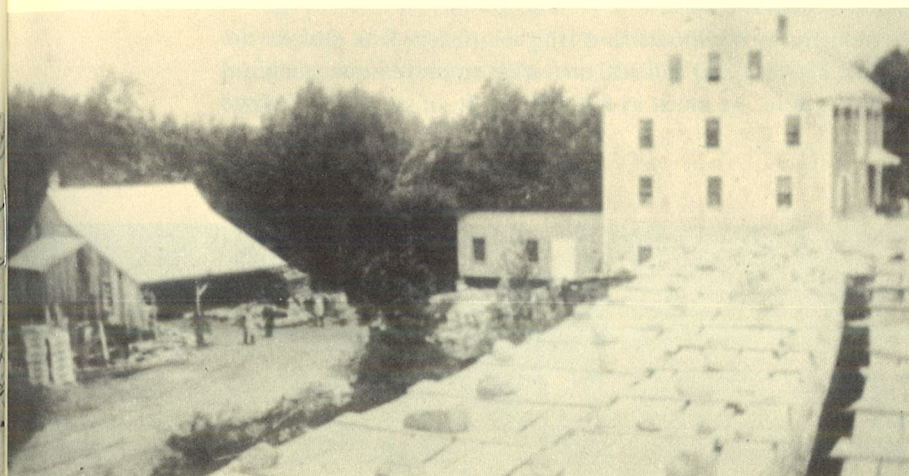
Reuben Loud's Mill