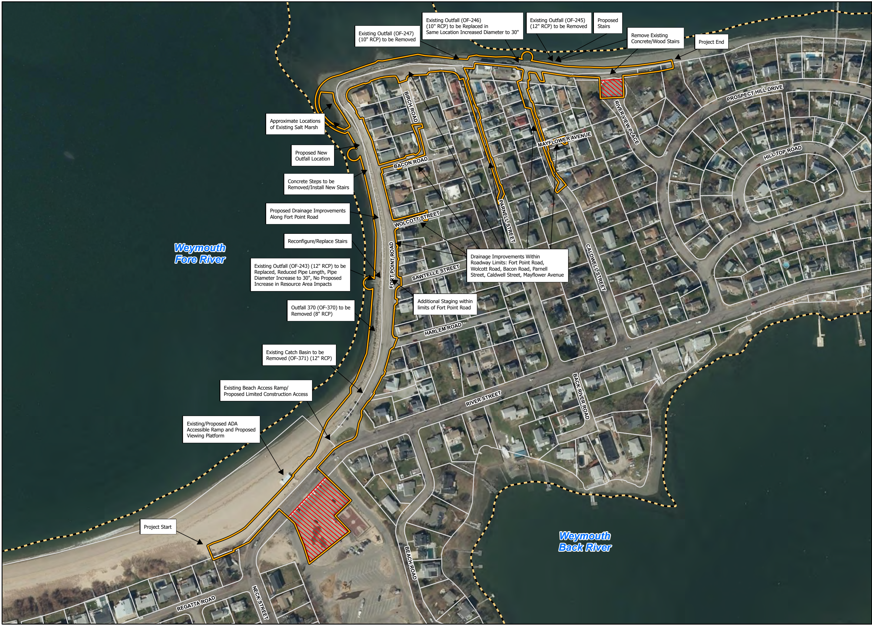
FIGURE 6 SITE PLAN