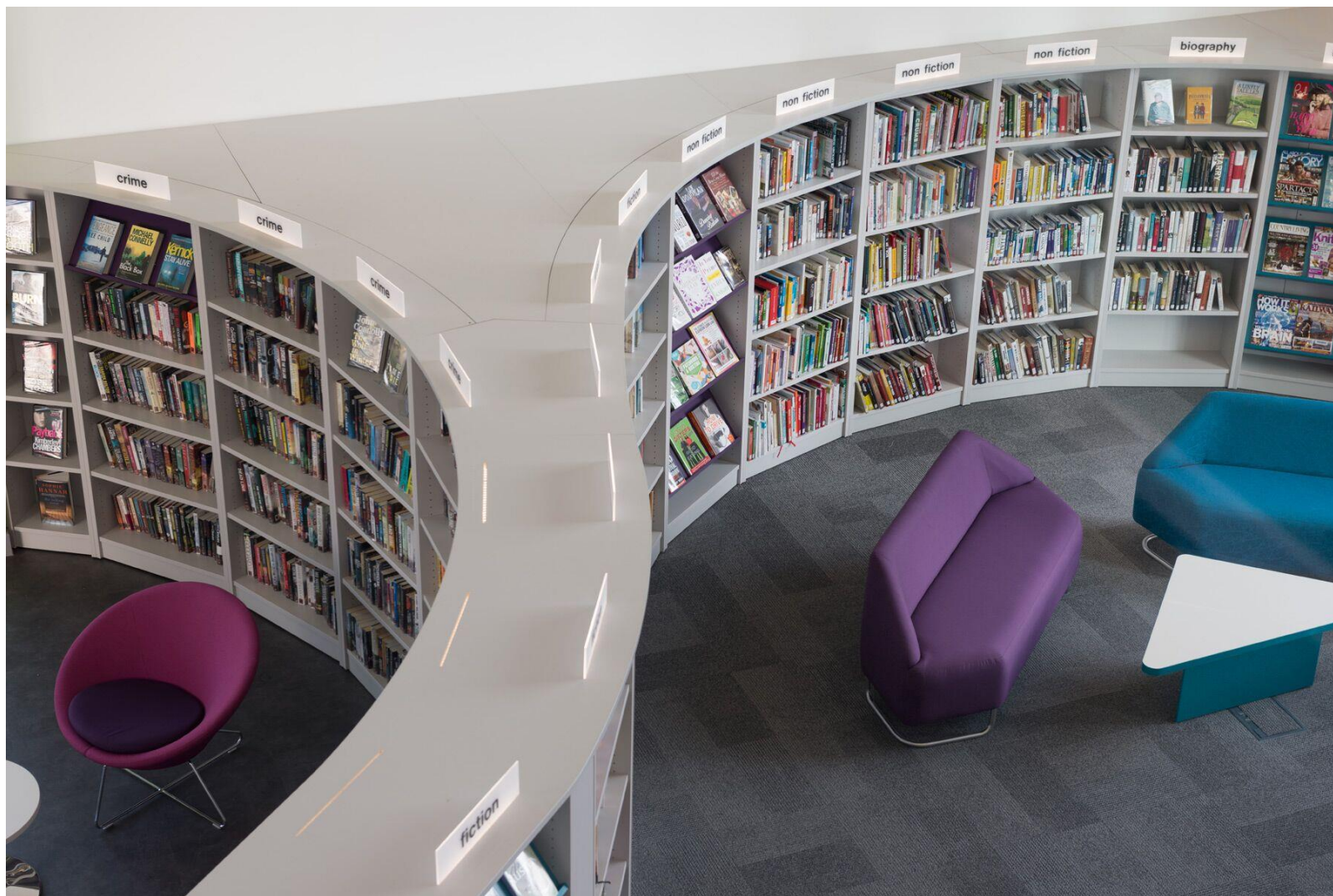
Kingston Lib, UK