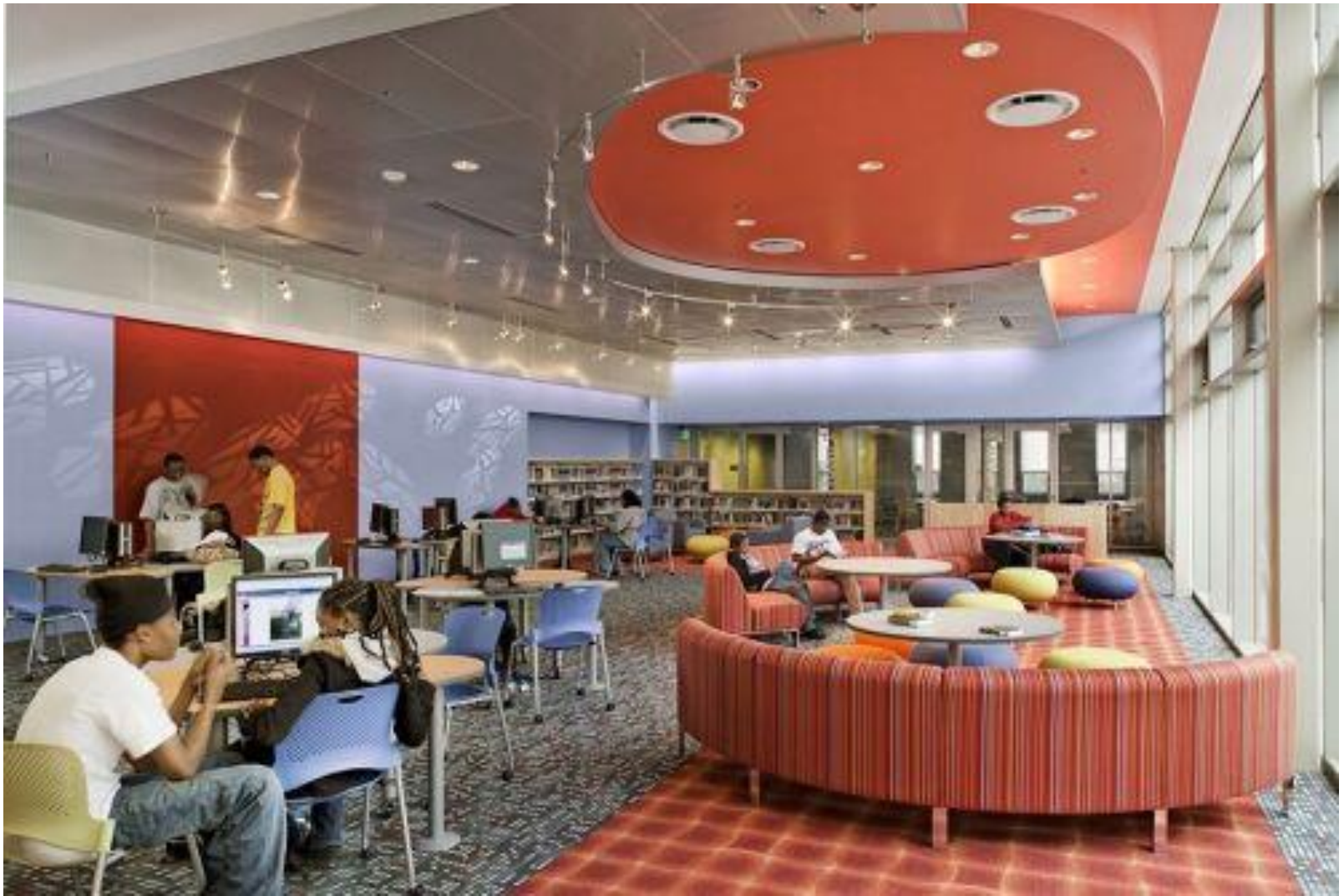
Boston - Mattapan