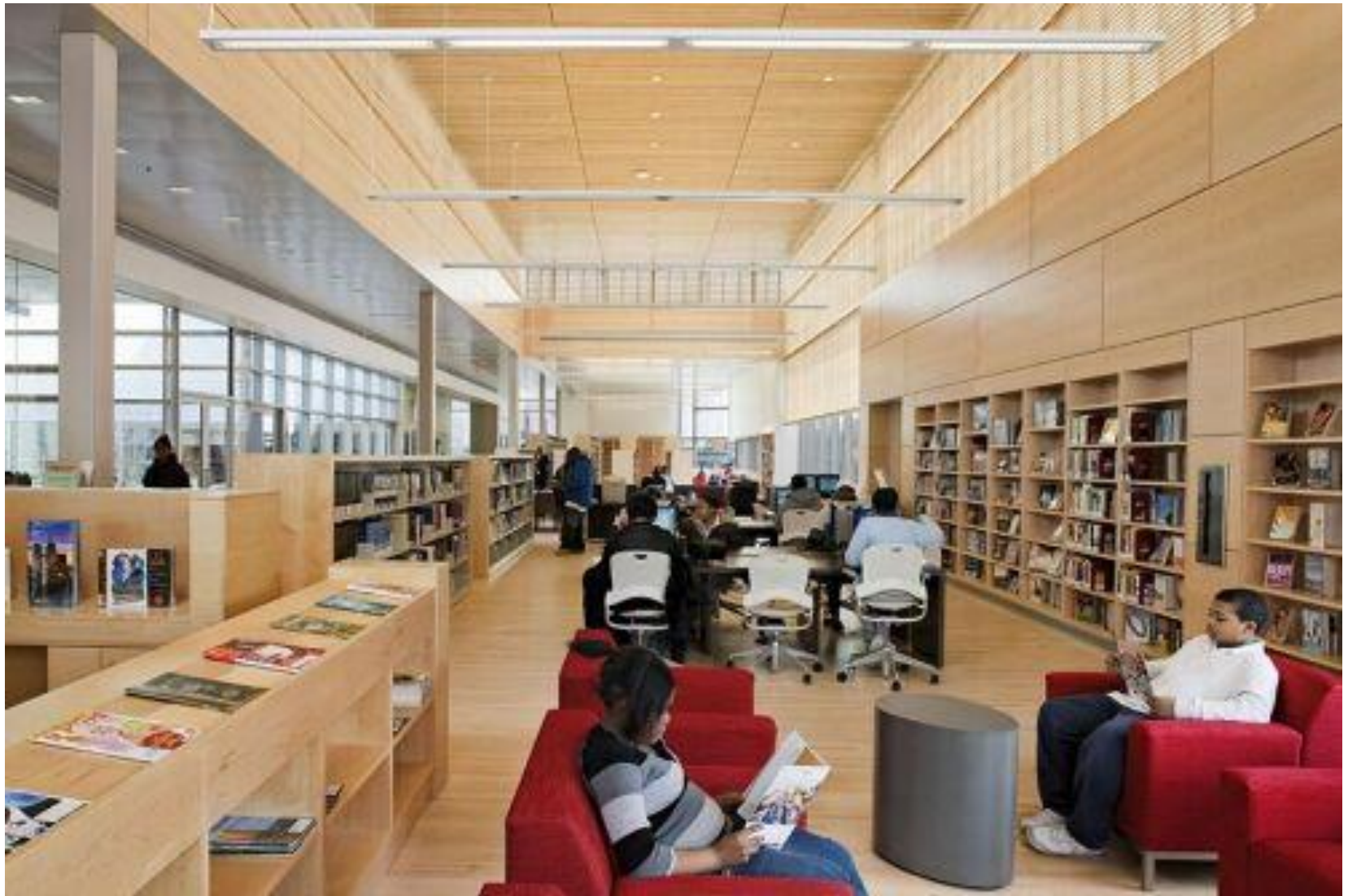
Boston - Mattapan