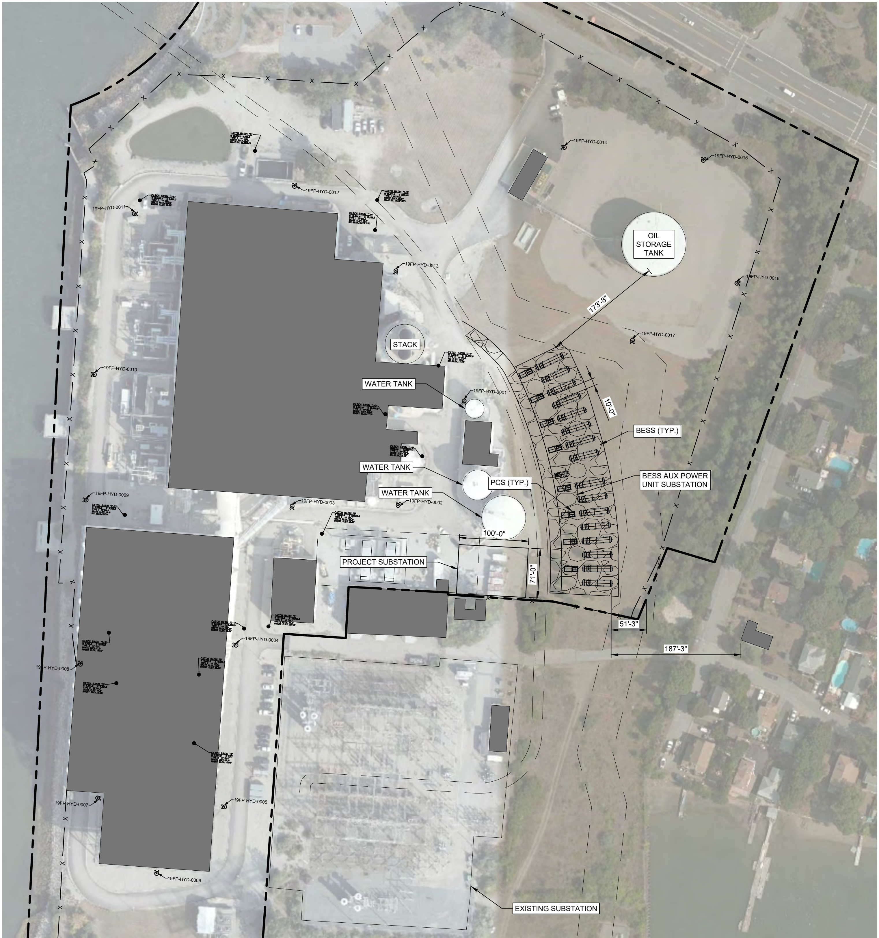
SITE PLAN 1" = 80'