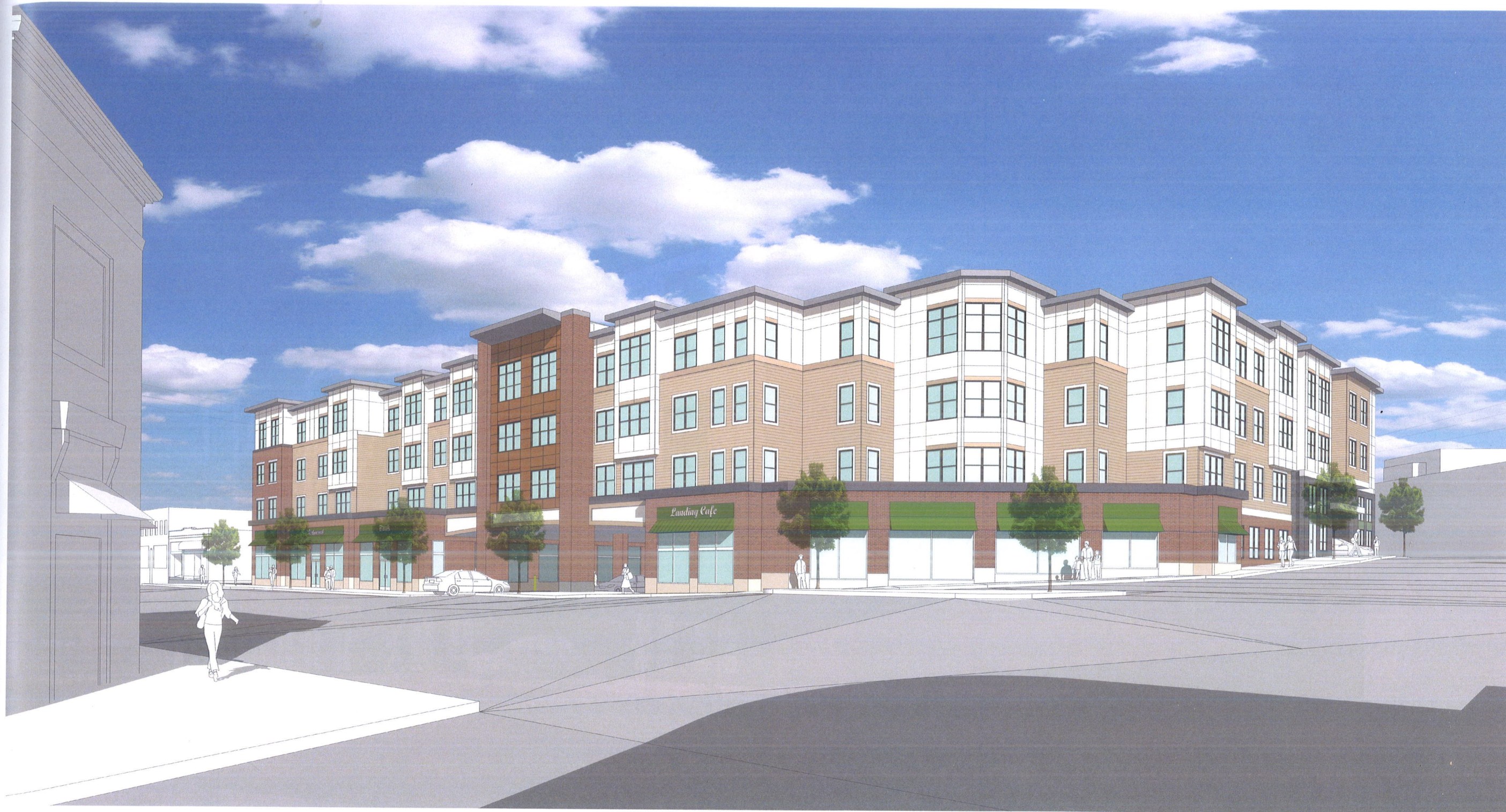
VIEW FROM FRONT STREET