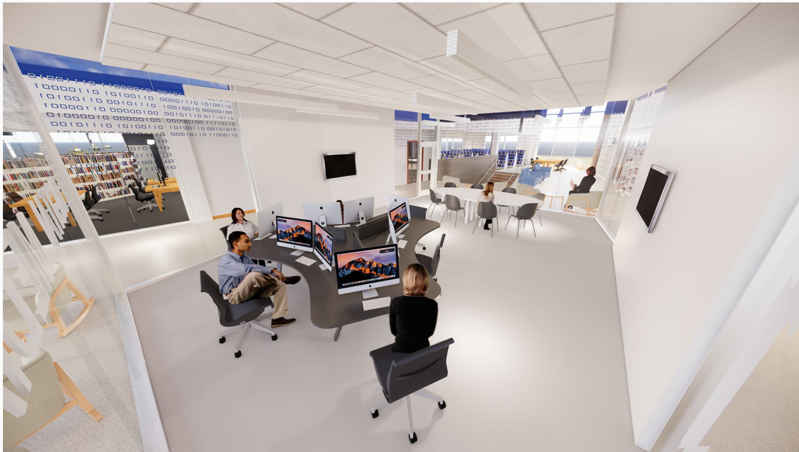
Digital Media Lab Rendering