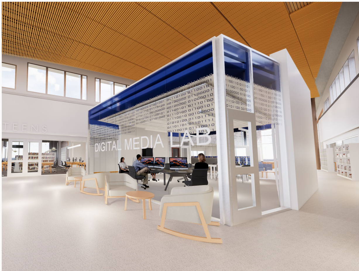
Digital Media Lab Rendering - Exterior