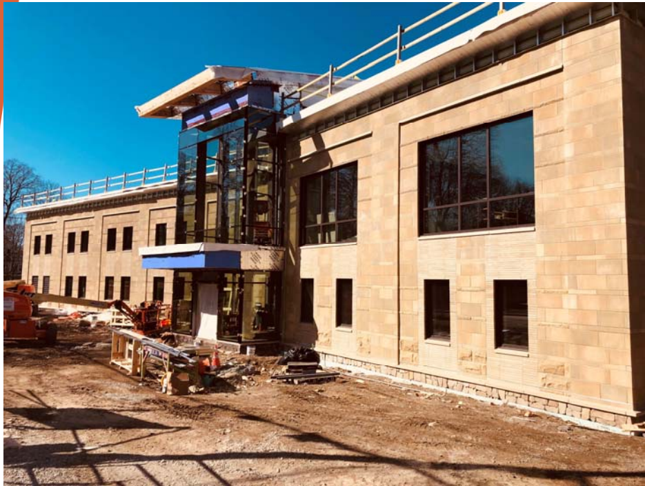
Building Exterior March 2, 2020