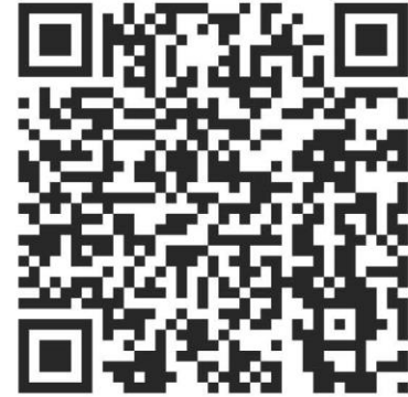
TOP OF SECOND FLOOR STAIR