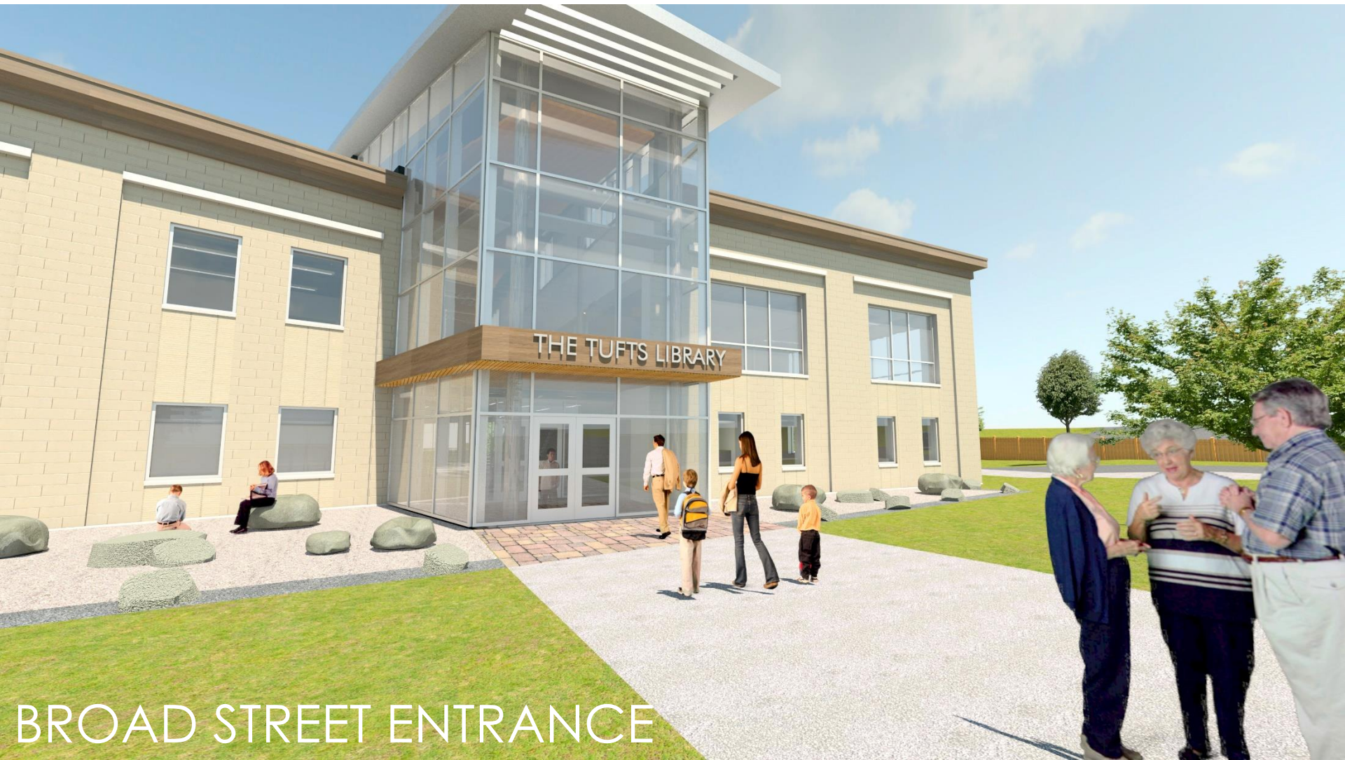
BROAD STREET ENTRANCE