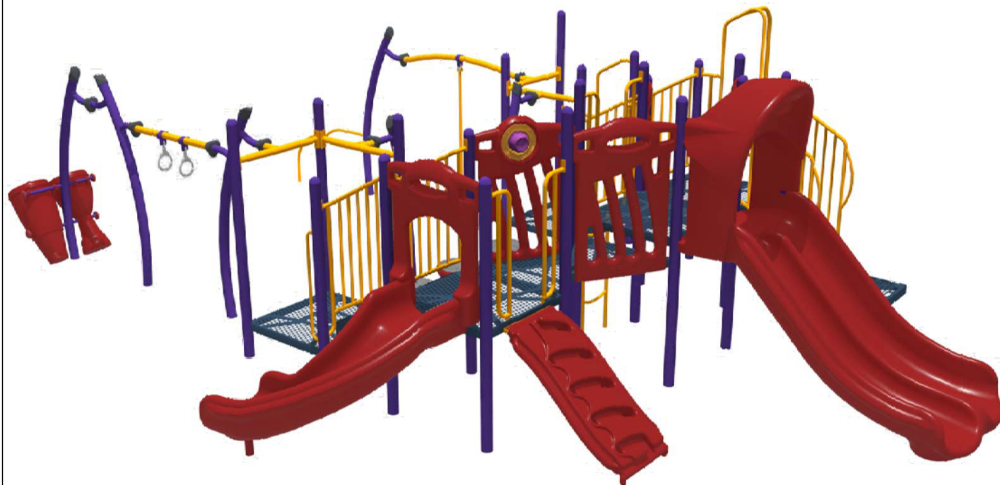
2 TO 5 YEAR OLDS PLAY EQUIPMENT ACCESSIBLE BY TRANSFER PLATFORM