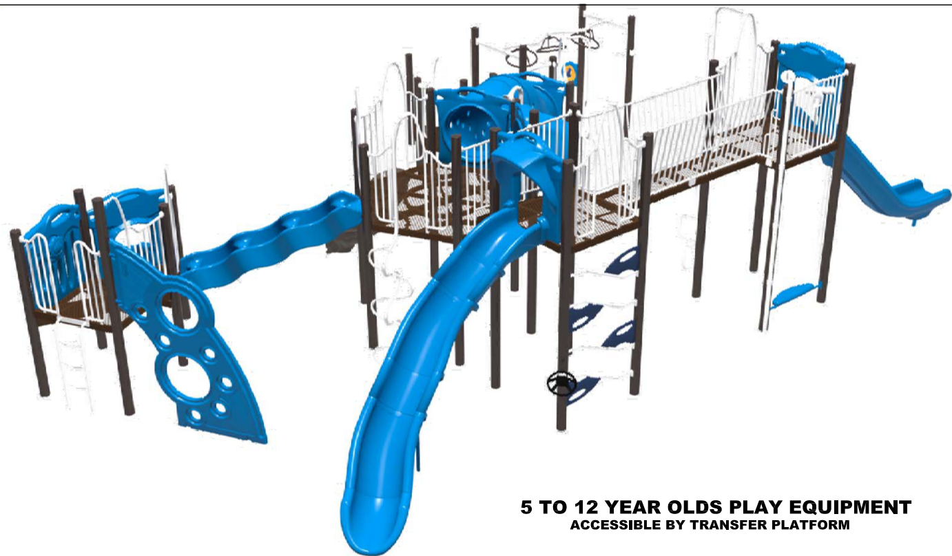
5 TO 12 YEAR OLDS PLAY EQUIPMENT ACCESSIBLE BY TRANSFER PLATFORM