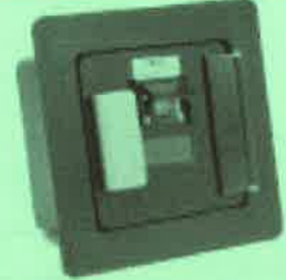
6000 Recessed Mounted- Hinged Door