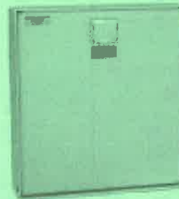
1500 Surface Mounted Storage Box