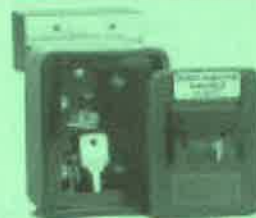
2500 Door Hung Mounted