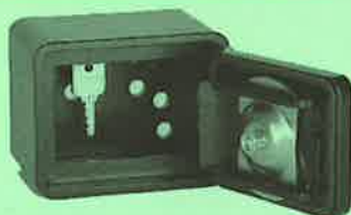
5000H Surface Mounted - Hinged Door

Check here if products ordered on this form must be SUBMASTERED Add $9.00 to EACH item ordered