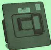
5000HR Recessed Mounted Hinged Door

EAS MODEL 5000H (Hinged Door) SURFACE MOUNTED KEY BOX 10 key capacity 4"H x 5"W x 3 1/4" D