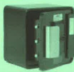
6000 Surface Mounted- Hinged Door