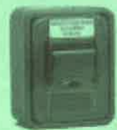
2500 Surface Mounted