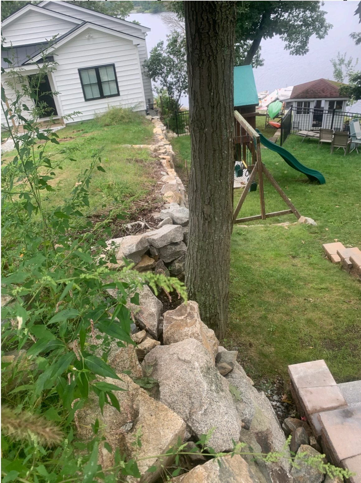
Photo 1: Northern property line looking towards Whitman's Pond (Stone retaining wall)