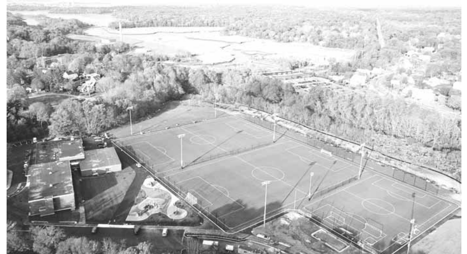
Aerial view of the new Lovell Playing Fields and Playground, with the Back River and new Osprey Overlook Park in the distance.