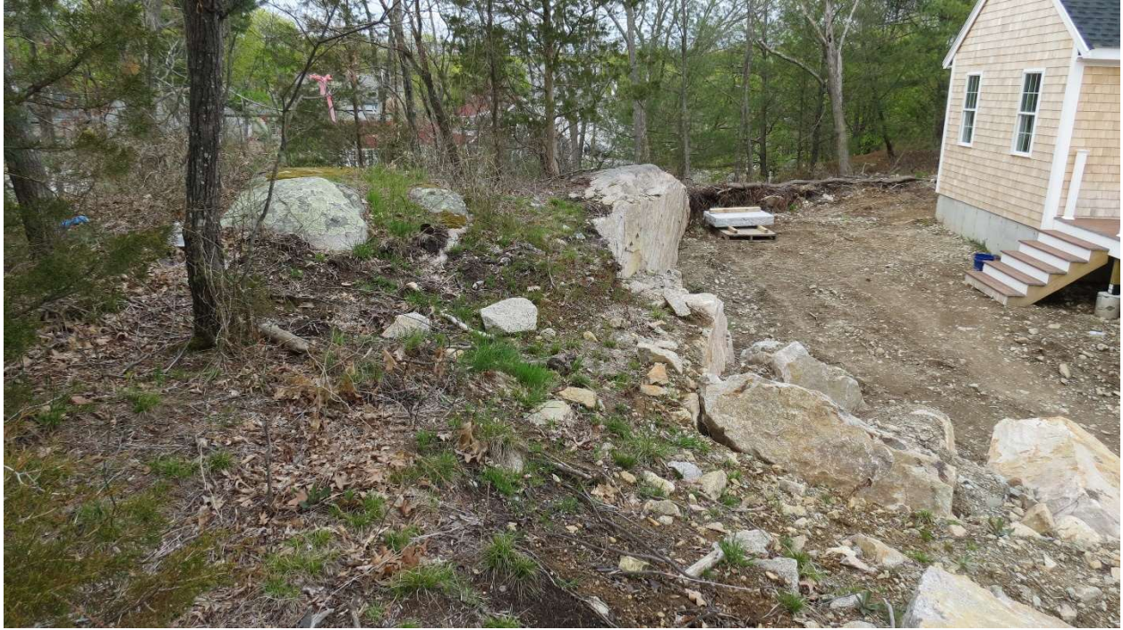
File No. 81-1247 Ryder 734 Pleasant Street Weymouth – Rear View Looking North – 4/28/2021