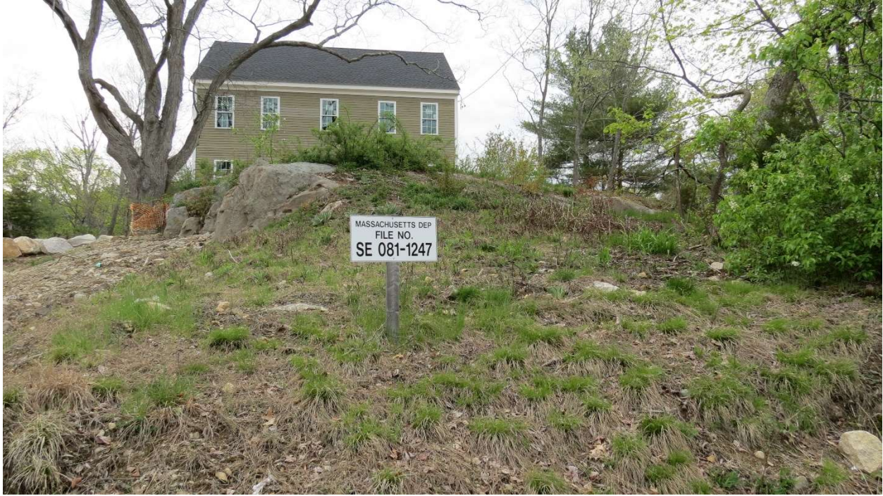
File No. 81-1247 Ryder 734 Pleasant Street Weymouth – Street View - 4/28/2021