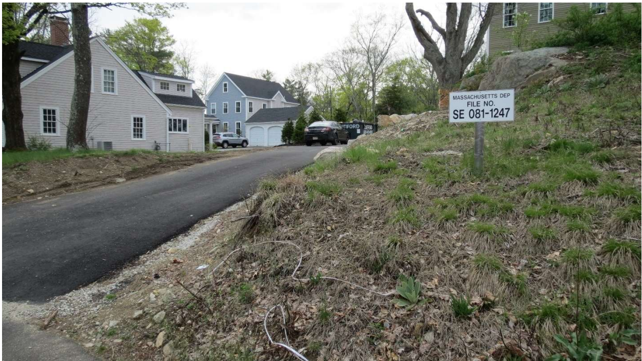
File No. 81-1247 Ryder 734 Pleasant Street Weymouth – Street View/Driveway - 4/28/2021