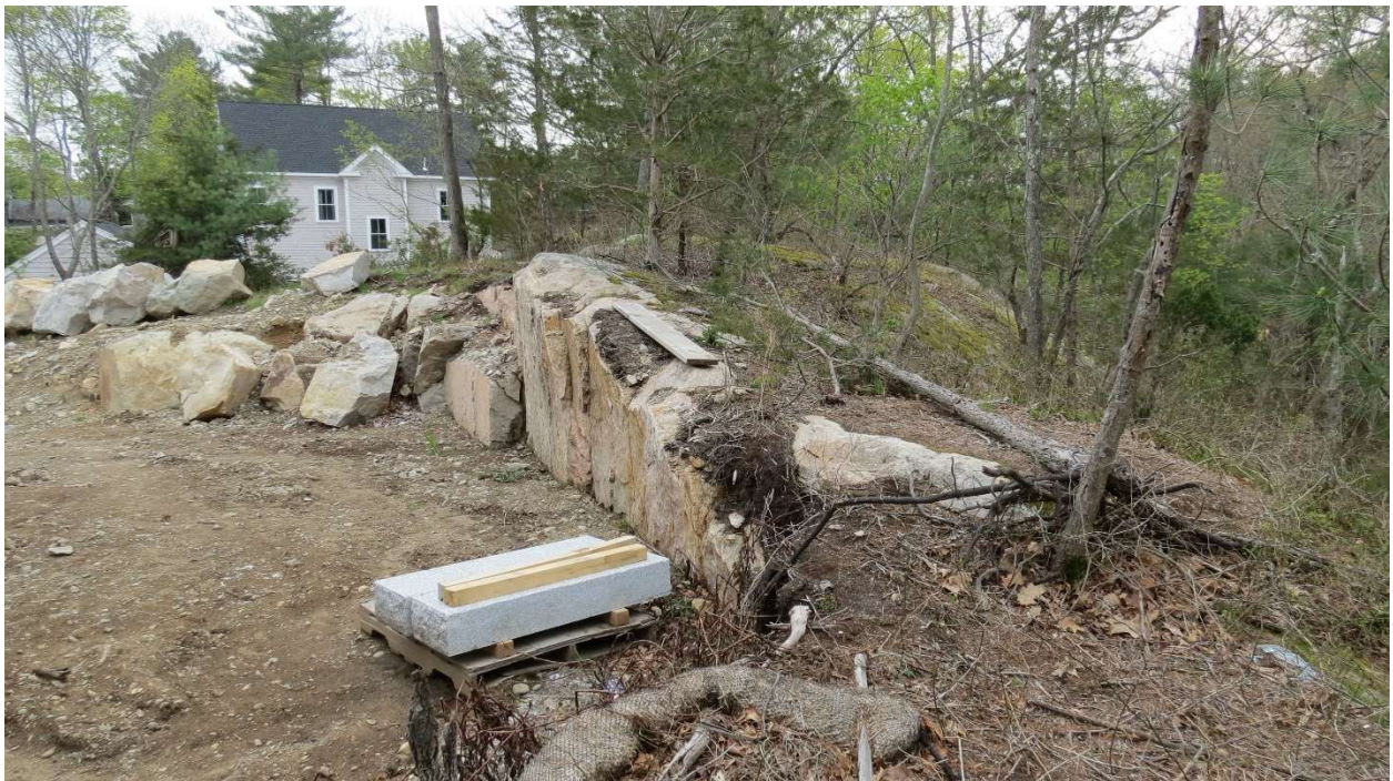
File No. 81-1247 Ryder 734 Pleasant Street Weymouth – Rear View Looking Southwest – 4/28/2021