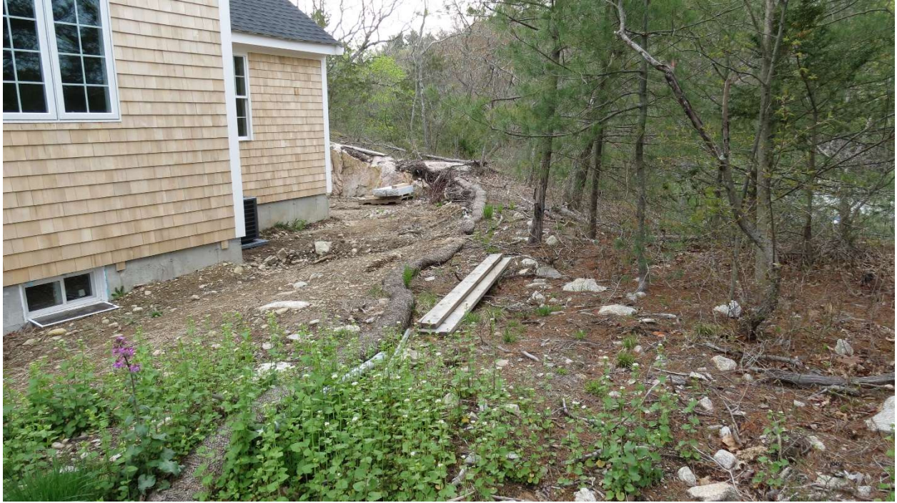
File No. 81-1247 Ryder 734 Pleasant Street Weymouth – Side View Looking Northwest 4/28/2021