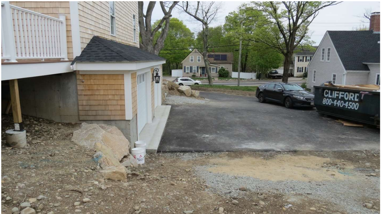
File No. 81-1247 Ryder 734 Pleasant Street Weymouth – Side View Looking Southeast 4/28/2021