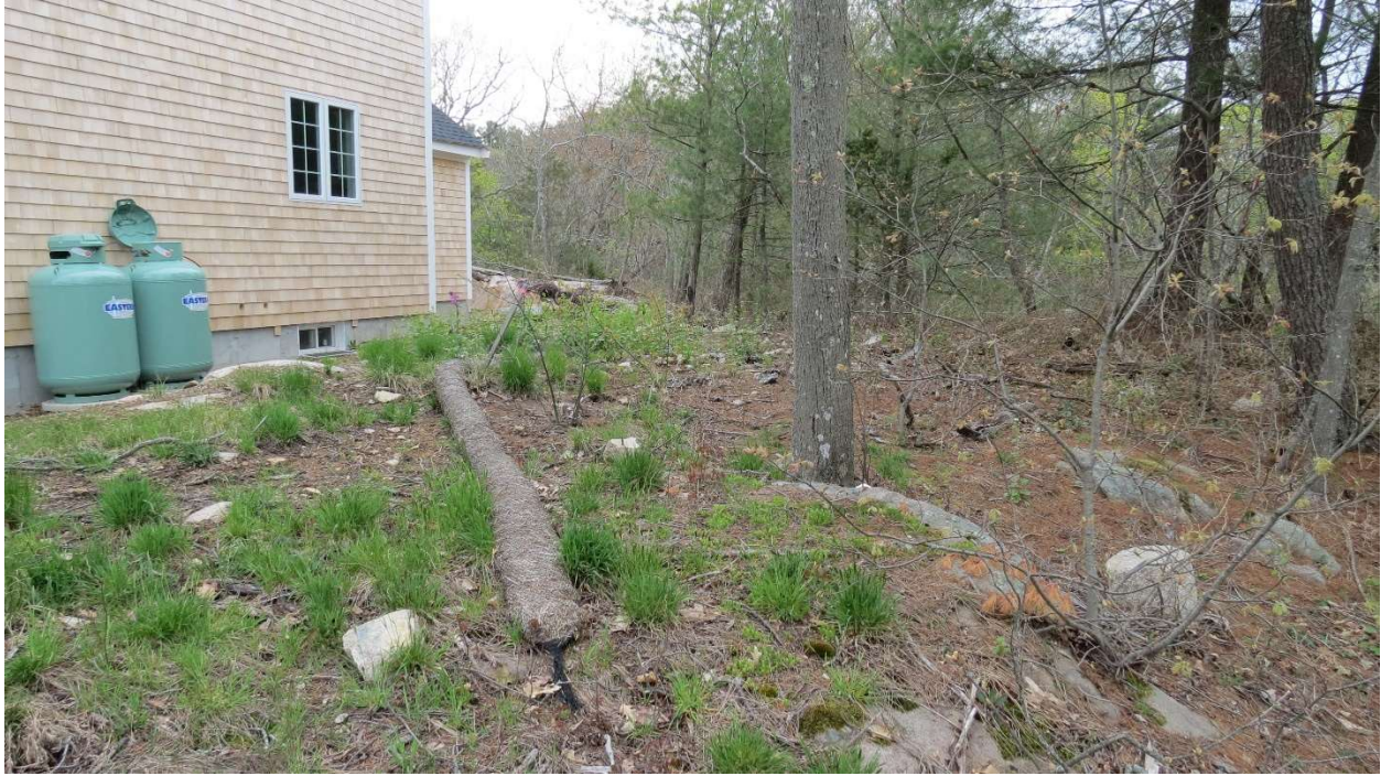
File No. 81-1247 Ryder 734 Pleasant Street Weymouth – Side View Looking Northwest 4/28/2021