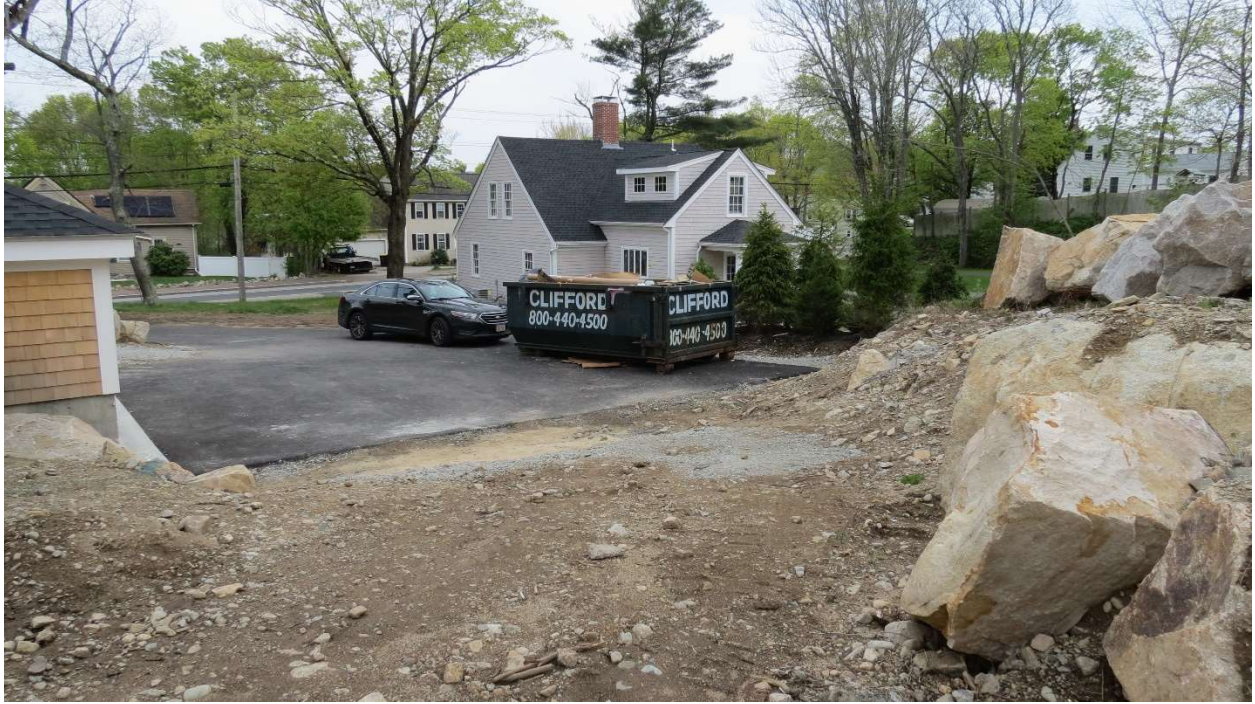
File No. 81-1247 Ryder 734 Pleasant Street Weymouth – Rear/Side View Looking South 4/28/2021