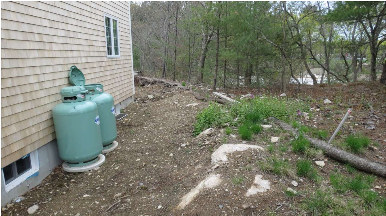
File No. 81-1247 Ryder 734 Pleasant Street Weymouth – Side View Looking Northwest 4/28/2021