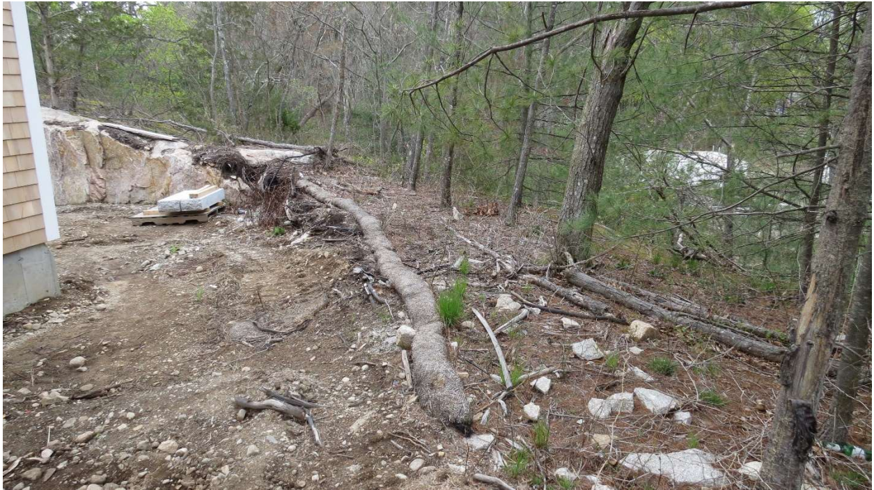
File No. 81-1247 Ryder 734 Pleasant Street Weymouth – Side View Looking West – 4/28/2021