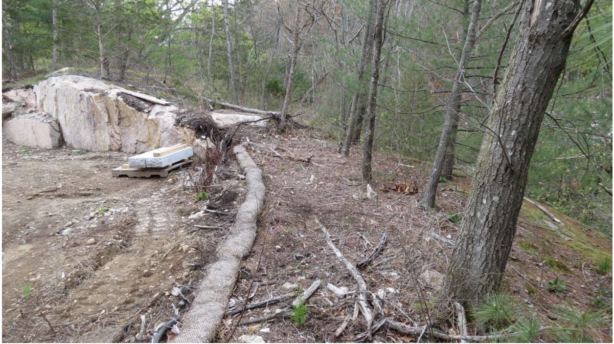
File No. 81-1247 Ryder 734 Pleasant Street Weymouth – Side View Looking West – 4/28/2021