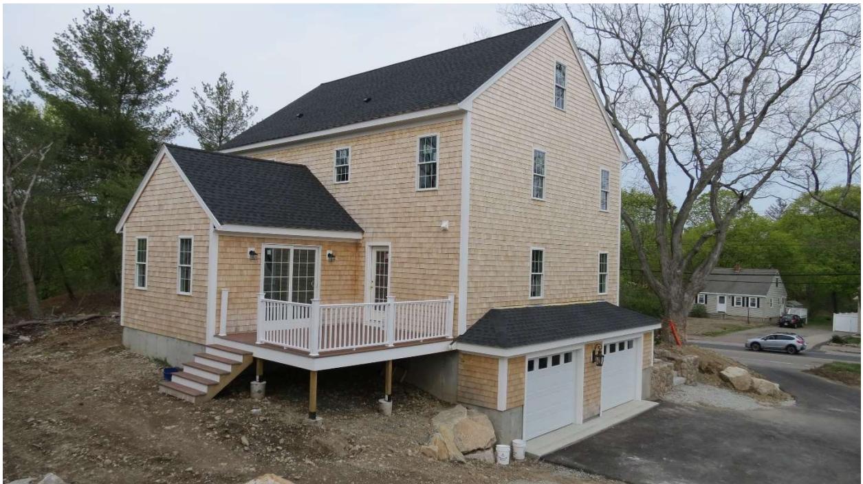
File No. 81-1247 Ryder 734 Pleasant Street Weymouth – Rear View Looking Northeast 4/28/2021