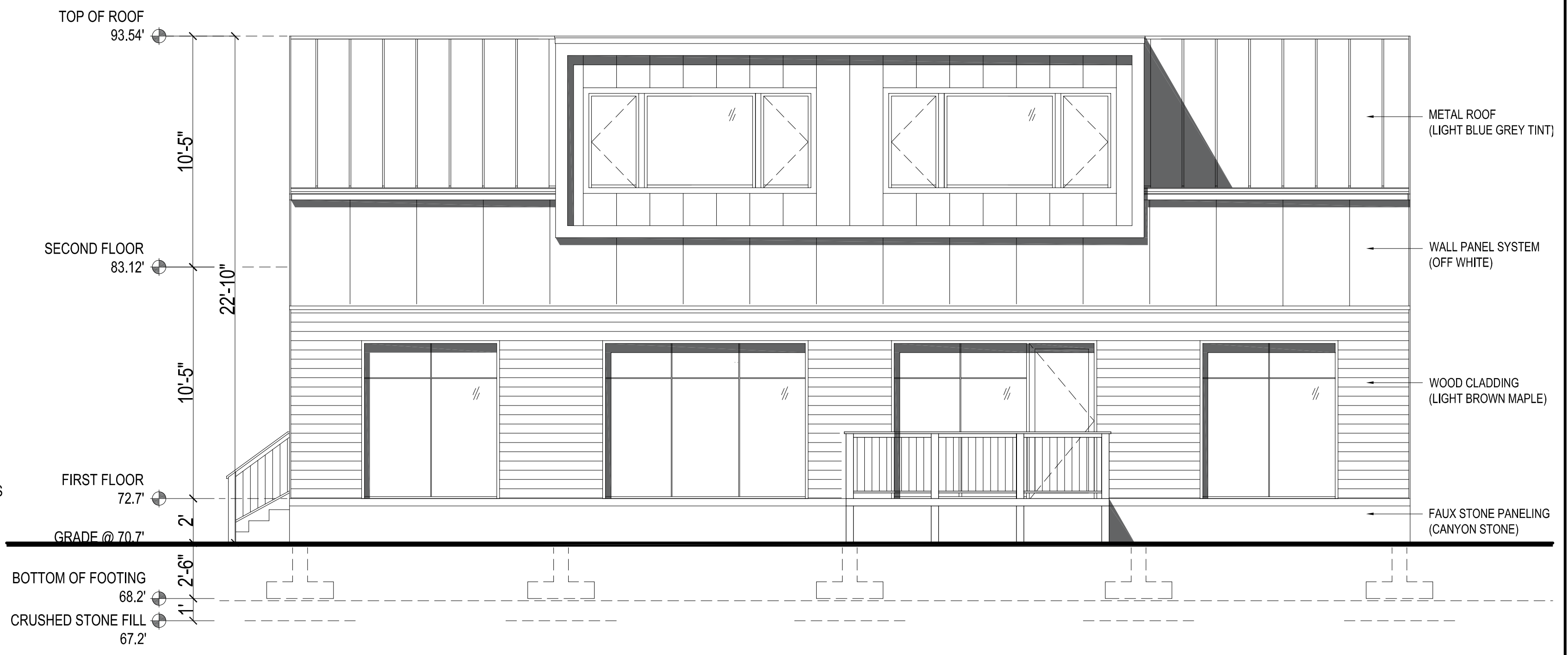
2 EAST ELEVATION A-3 SCALE: 1/4"=1'-0"