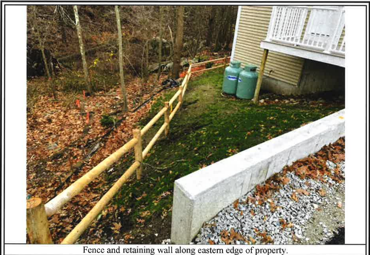
Fence and retaining wall along eastern edge of property.

PHOTOGRAPHIC DOCUMENTATION 32 Beecher Street Weymouth, Massachusetts