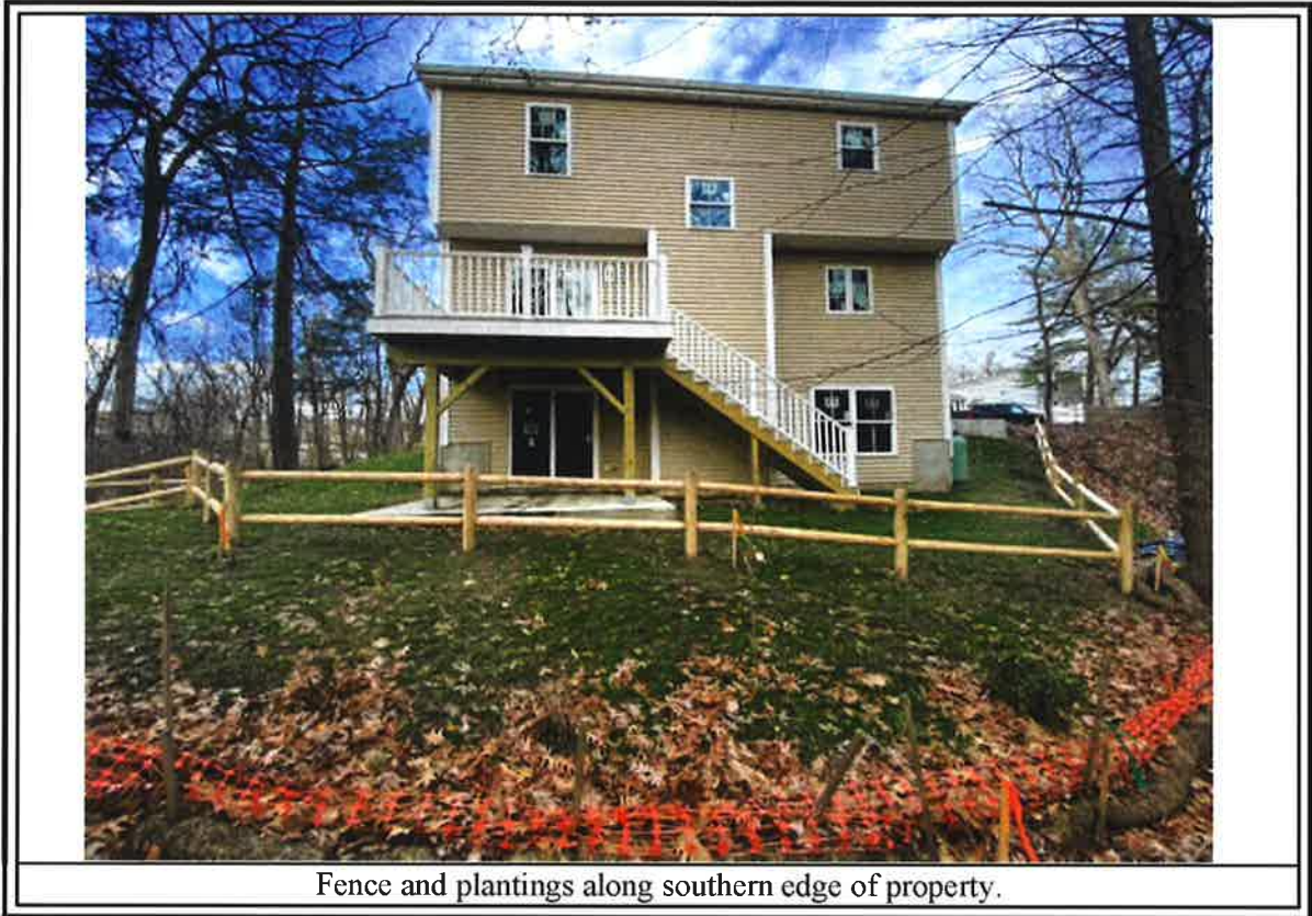
Fence and plantings along southern edge of property.