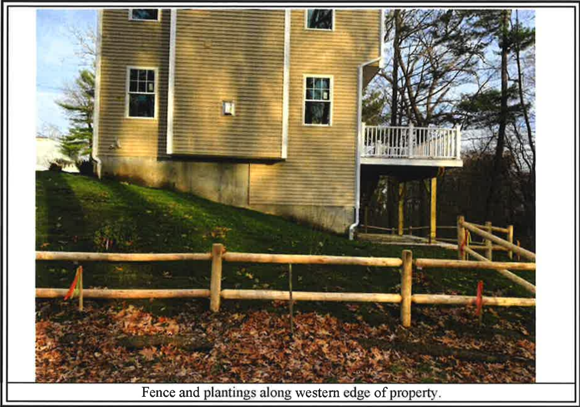
Fence and plantings along western edge of property.