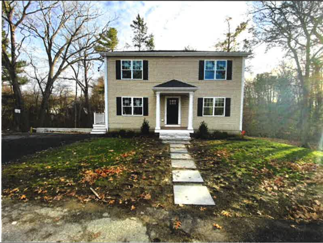
32 Beecher Street dwelling from Beecher Street.