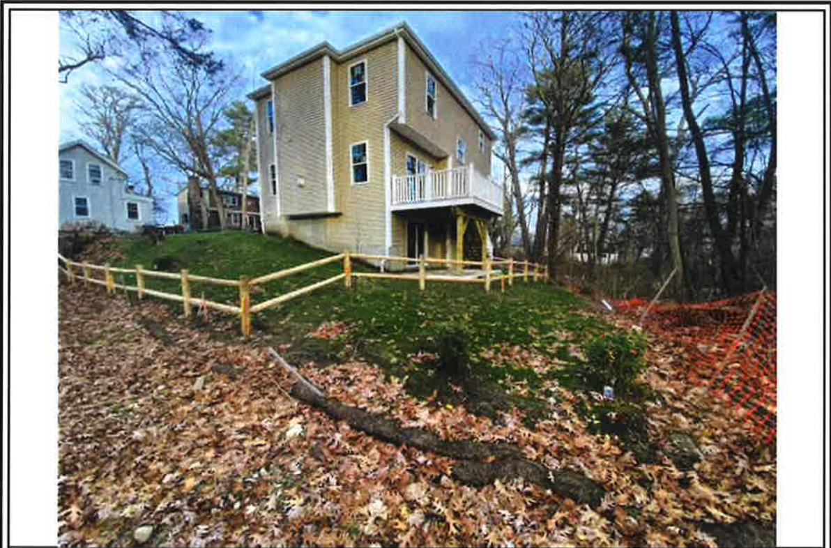
Fence and plantings in southwestern corner of property.

PHOTOGRAPHIC DOCUMENTATION 32 Beecher Street Weymouth, Massachusetts