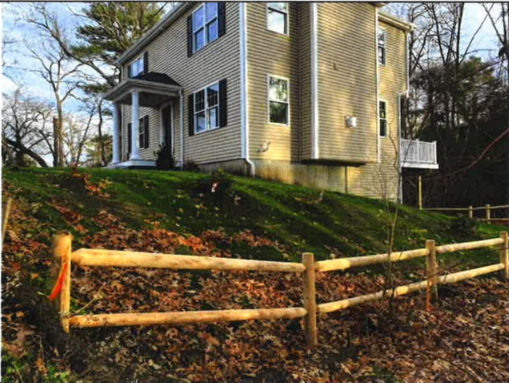
Fence and plantings in northwestern corner of property.

PHOTOGRAPHIC DOCUMENTATION 32 Beecher Street Weymouth, Massachusetts