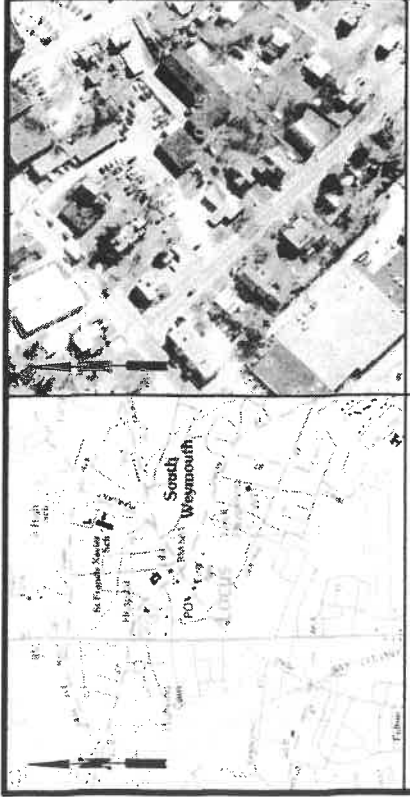
Project Locus Scale: 1" = 2000 Feet ±